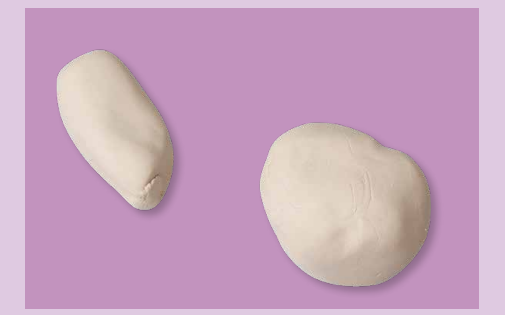
1. Cut pieces of clay using the pottery wire tool. Create a body out of clay that weighs 60 grams and a neck and head that weighs 25 grams.