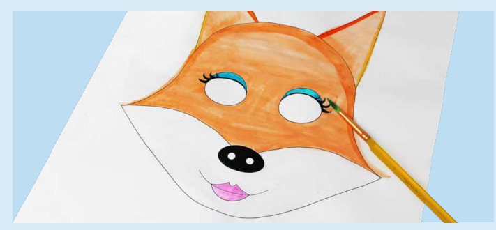
1. Use the template provided on page 9 and print out onto A3 cover paper. Colour in Dora von Dooze. We have used watercolour paints but you could also use pencils or markers to decorate. Allow to dry if needed.