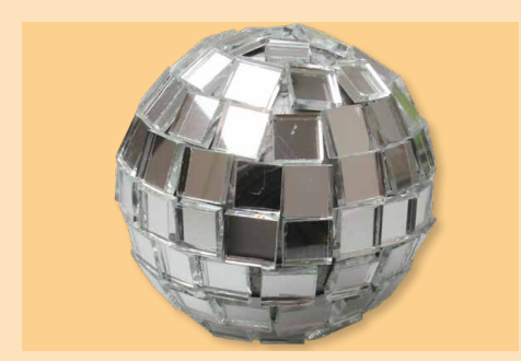
3. Remove the skewer and finish adding mosaics to the bottom half of the decofoam ball. Leave a gap at either the top or bottom of the decofoam ball so that you can add a string for hanging.