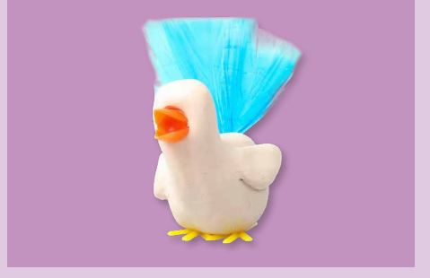
3. Use 10 grams of clay to create two wings and attach them to either side of the clay body. While the clay is still soft, add the beak, feet and tail feathers. Allow the clay to dry completely.