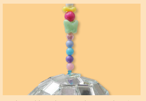
5. Thread beads onto the spaghetti string to add a touch of colour! To finish, tie a knot in the other end to keep the beads in place. Your Disco Ball is now ready to hang!