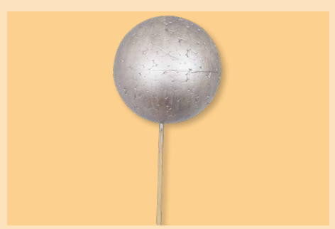
1. Use a skewer to hold your decofoam ball while you paint it silver. Allow to dry.

Become a diva like Whitney and Britney with your own mini disco ball!