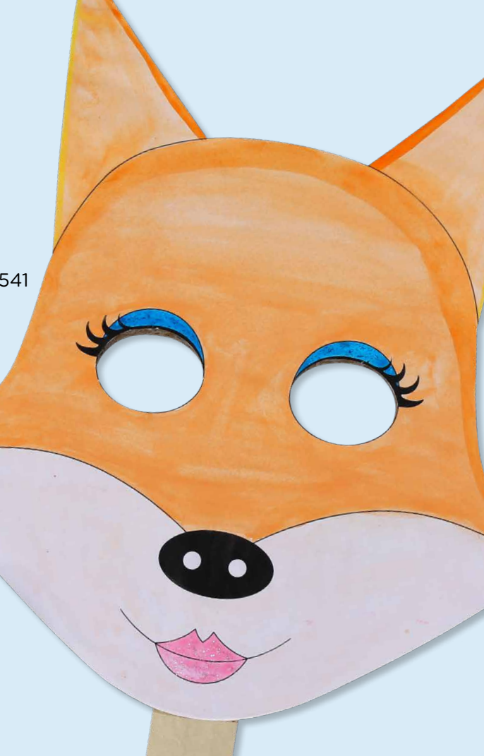
It's Dora von Dooze the famous performer!