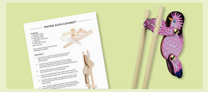
4. Use the instruction sheet within the CleverKit<sup>™</sup> to construct your Trapeze Chicken Diva. Now your Chicken Diva is ready to perform!