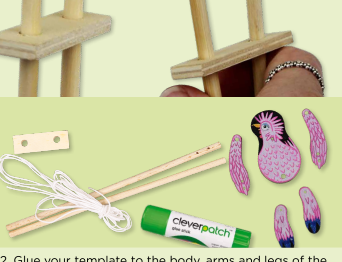
2. Glue your template to the body, arms and legs of the Sloth CleverKit™. Make sure you glue a template to the front and back of each piece. Allow to dry.