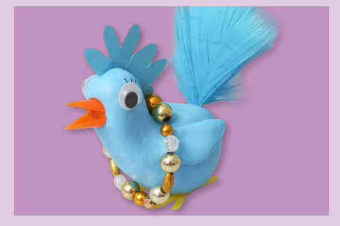
6. Use a Stay Anywhere™ pen to add eyelashes to your chicken. Add some bling by creating a necklace for your Chicken Diva using craft line and beads. Now your Clay Chicken Diva is ready!