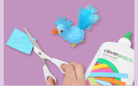
5. Sketch out a comb for your chicken's head using coloured cardboard and cut out. Adult supervision is recommended when using scissors. Use PVA glue to attach the cardboard to your chicken. Attach 2 wiggle eyes using PVA glue. Allow to dry.