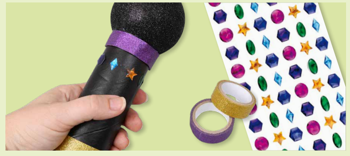
4. Decorate your microphone using Glitter Washi Tape and Stick On Jewels. You are now ready to sing a jazz number like Foxy and the Chickettes!

2. Place the painted decofoam ball onto a skewer so you can cover it entirely in CleverPatch™ Junior PVA Glue. While the glue is still tacky, sprinkle glitter over the decofoam ball. Allow to dry. For less glitter wastage, use a scrap piece of paper folded in half to catch the glitter falling off the decofoam ball while decorating. This will make it easy to tip the glitter back into the container ready to use!