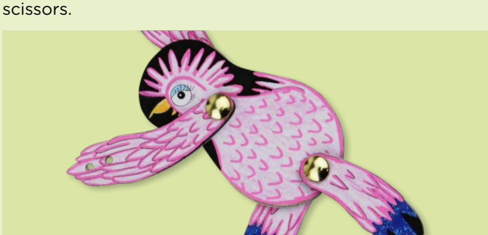
3. Add holes in your template that align with the holes on the Sloth CleverKit ^{\text{\tiny{M}}} . Attach the arms and legs using the split pins provided.

1. Print out the template provided on page 8. Use pencils, POSCA markers and CleverPatch™ glitter glue to decorate your template. We have chosen to make our template look like Whitney! Allow to dry. Cut out your template. Adult supervision is recommended when using scissors