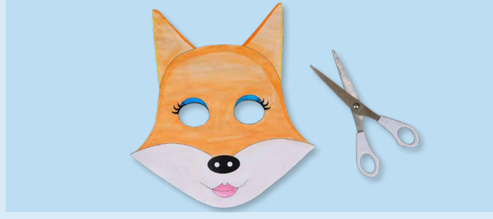
3. Cut out your template. Adult supervision is recommended when using scissors.