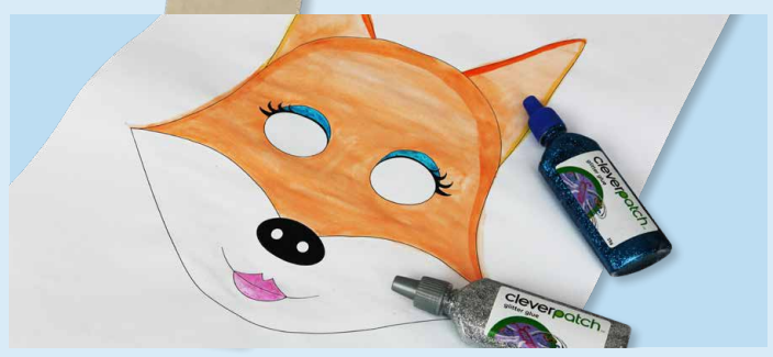
2. Use CleverPatch™ Glitter Glue to add some shimmer and shine to your mask! Allow to dry.