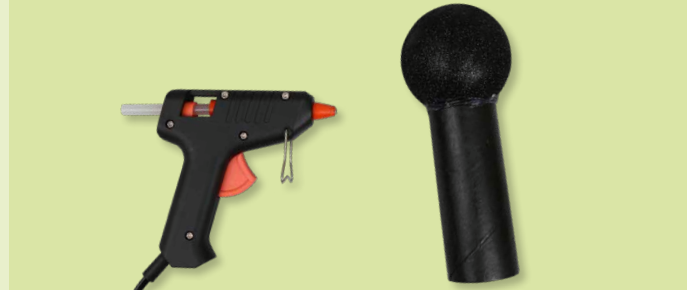
3. Use a glue gun to attach the glitter foam ball to one end of the cardboard roll. Allow to dry. Adult supervision is recommended when using a glue gun.